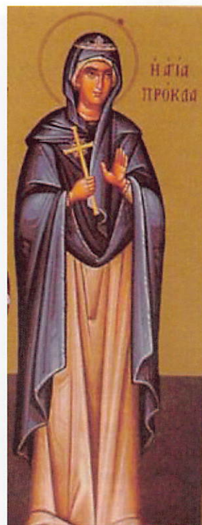
Greek icon of Pilate's wife as Saint Claudia Procula.

When Matthew pens his version of the Passion Narrative, Pilate's wife, a powerful Roman woman married to one of history's most despised men, is counted among the villains who plot and scheme against Jesus. Over time, however, she is elevated from co-conspirator in the death of Jesus to a sort of Jesus sympathizer, but why? The tendency to view her