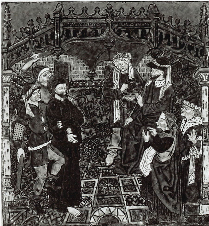
Christ Before Pontius Pilate, Monvaerni Master, The Walters Art Gallery

of the upper class, we can assume that Pilate's wife is accustomed to a comfortable lifestyle, afforded some level of education, and though she is not allowed to vote or hold office, Pilate's wife is able to offer her husband political advice.