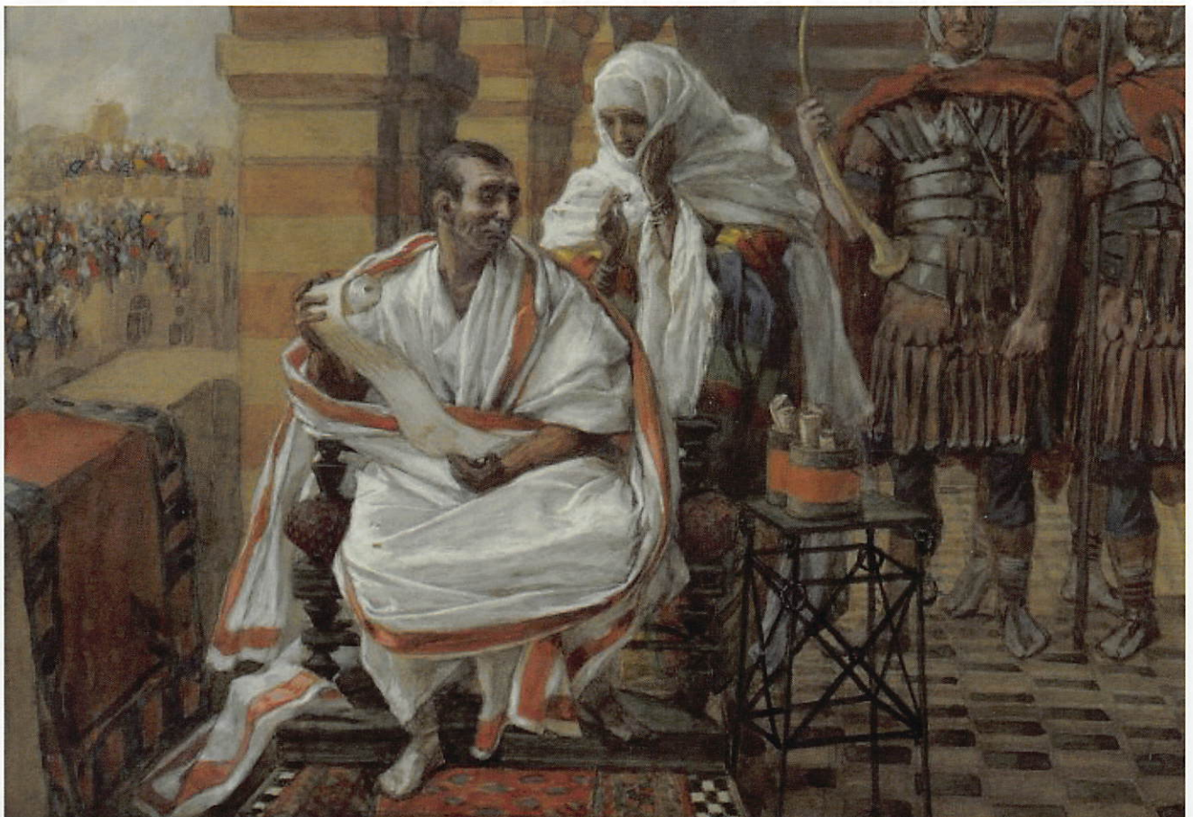
The Message of Pilate's Wife , James Tissot (1836-1902), Painting Cycle: The Life of Christ, Brooklyn Museum

Returning to the trial, Matthew reports that Pilate, believing Jesus to be innocent, bargains with the unruly crowd. "While he [Pilate] was seated on the judgment seat" (Matthew 27:19), in the midst of