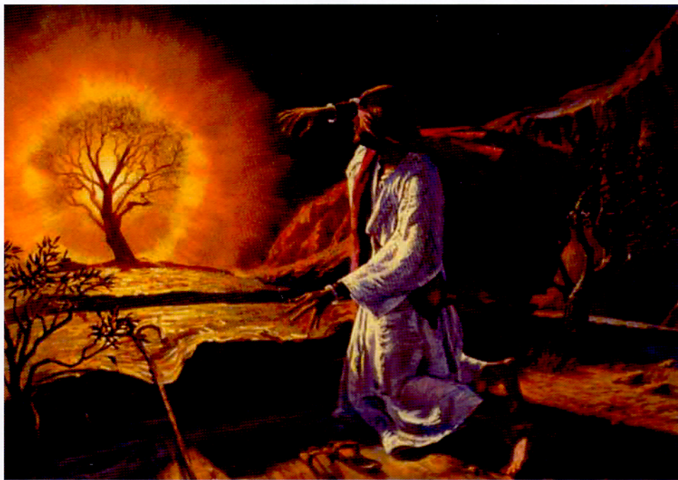
Moses approaches the burning bush in Sinai.

This was the wilderness of Sinai, far from the Promised Land to the north. For Moses, this was a land of exile. How could