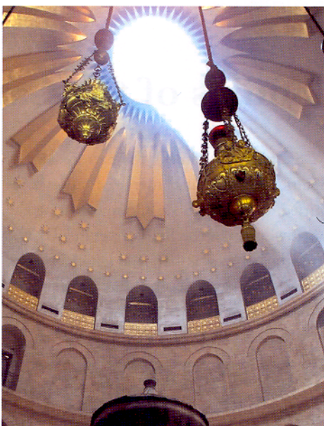
Dome of the Church of the Holy Sepulchre

place? Ancient oil lamps hanging from smoke-darkened ceilings, worn stone floors from the feet of millions of pilgrims, cold walls and pillars looming high around you. But these walls enshrine the holy ground where God himself gave his life for our sins and rose from the dead to conquer death and open the heavenly doors to eternal life. This is not just good history and theology—this is cosmic grandeur and heady truth that would embarrass the best science fiction writer. Remember, fact is often stranger than fiction.