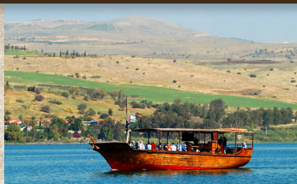
Sail on Galilee