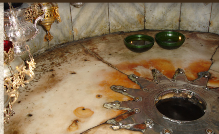
Touch the place where Jesus was Born